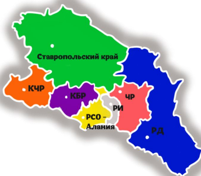
picture 1 Map of the North Caucasus Federal District North Caucasus Federal District (NCFD)